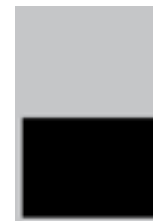
1/2 page 136mm x 190mm $250