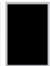
Full page 277mm x 190mm $450