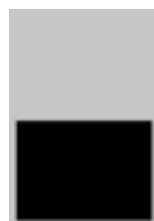
1/2 page 136mm x 190mm $275