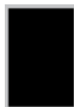
Full page 277mm x 190mm $495