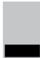
1/4 page 65mm x 190mm $150