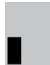
1/6 page 136mm x 65mm $110