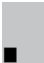
Double 70mm x 60mm $50