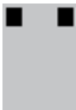
Ears 51mm x 45mm $80